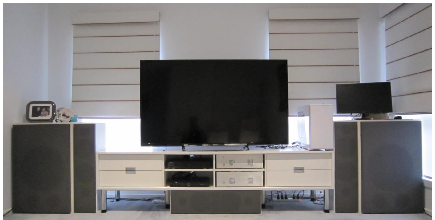
UE 8 System – July 2015

1. Replaced older Foxtel PayTV box with newer Foxtel iQ2 version – 5.1HT surround sound and HD picture quality are now available.