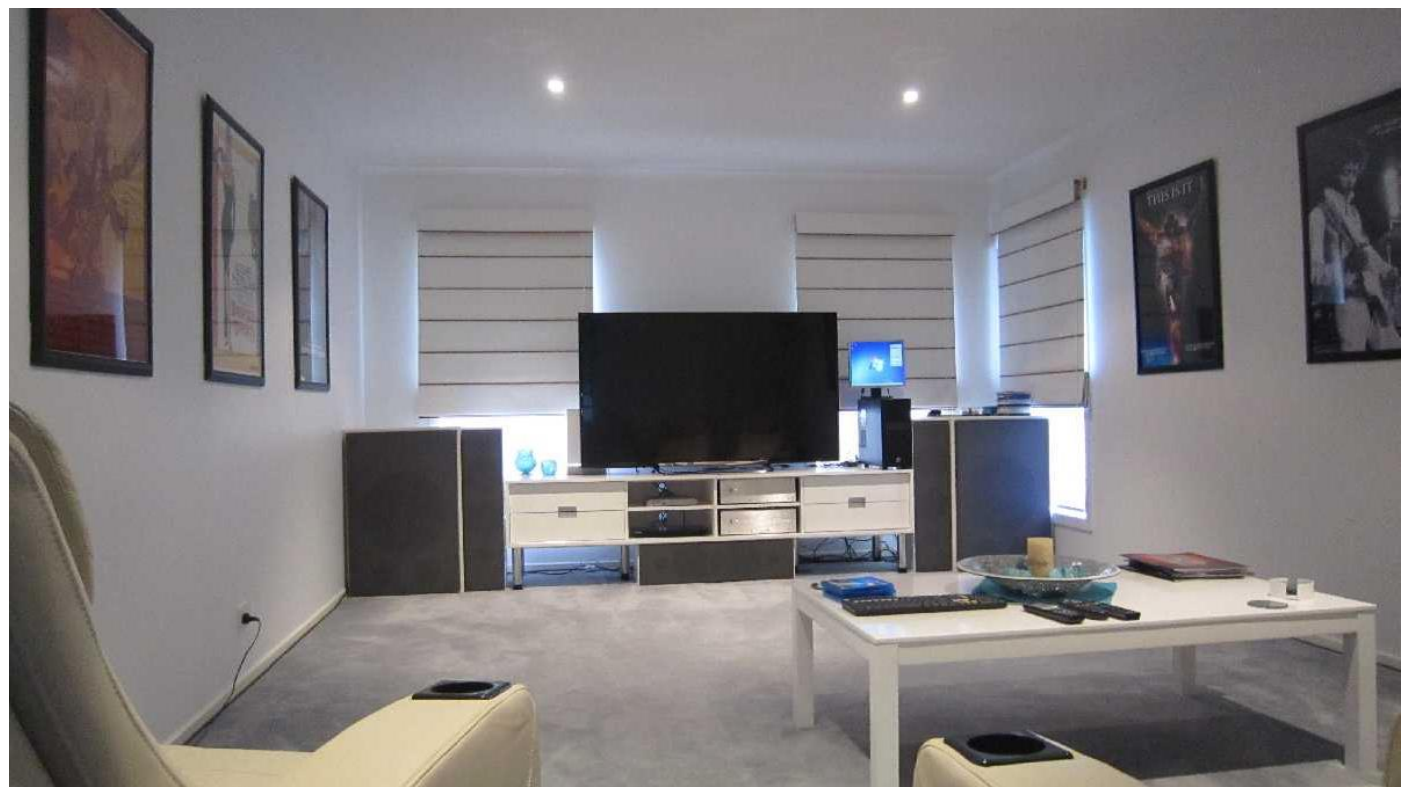
AV room - November 2013