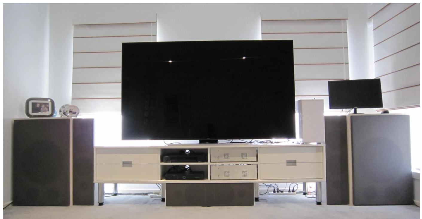
UE 9 System – December 2015

1. TV upgraded from Sony 70" 3D TV to Samsung 85" 4k TV with active 3D system.