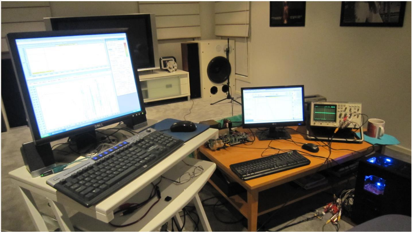
Early 2012 – transitioning from old Dali analogue system to new UE4 system.

At this stage, only the UE subwoofers were completed – measurements in progress.