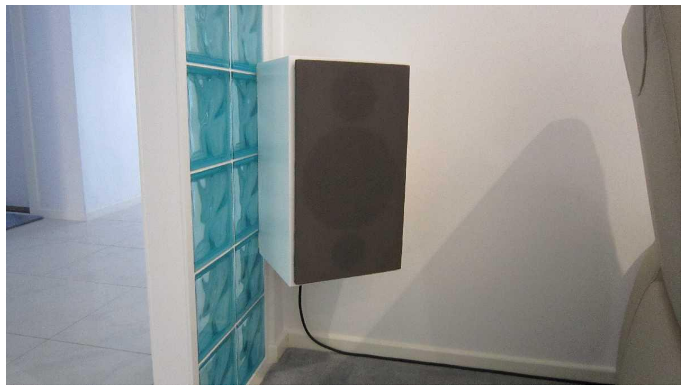
UE4 / 5 / 6 / 7 / 8 / 9 – rear speaker