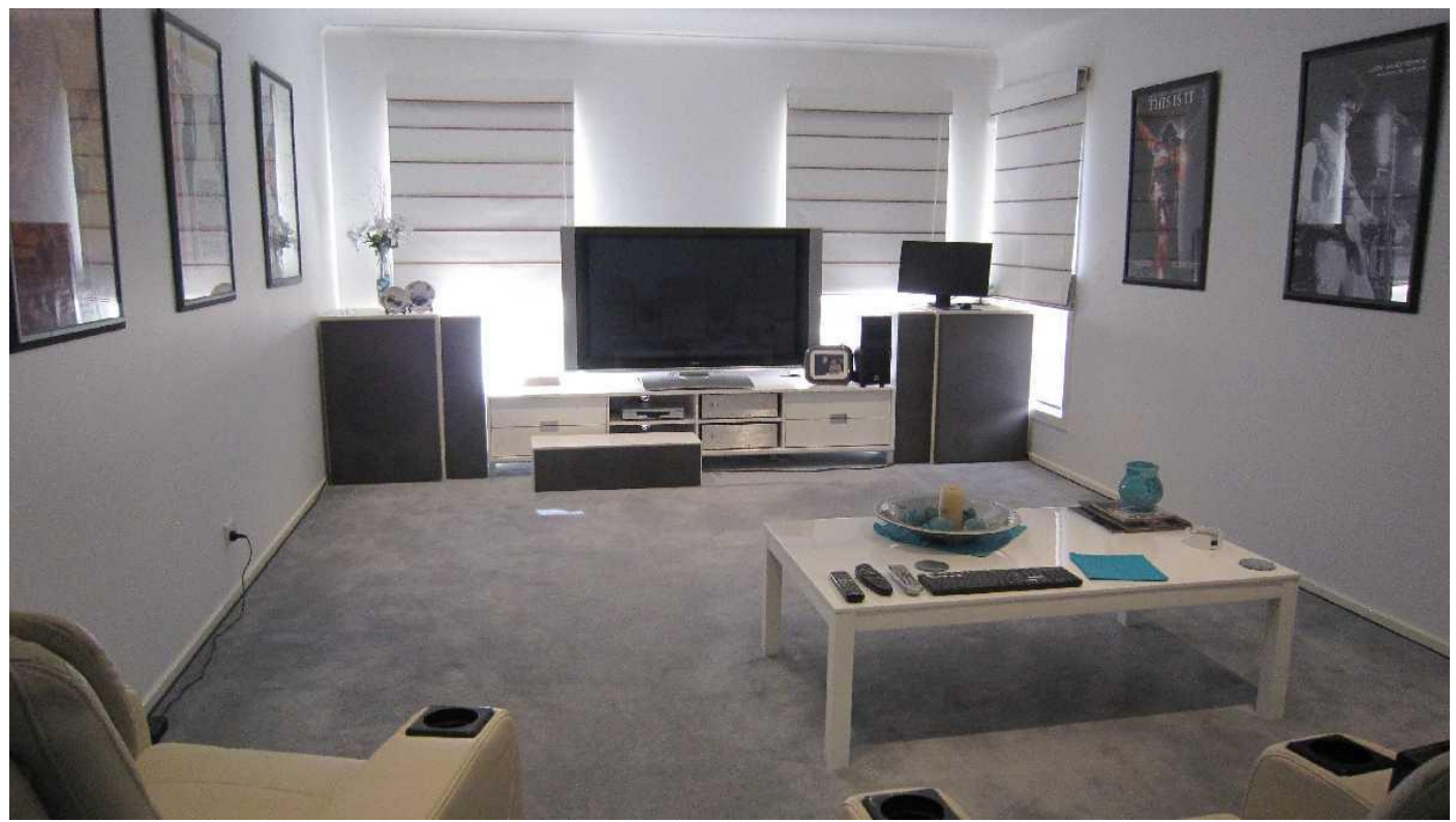
AV room - June 2012