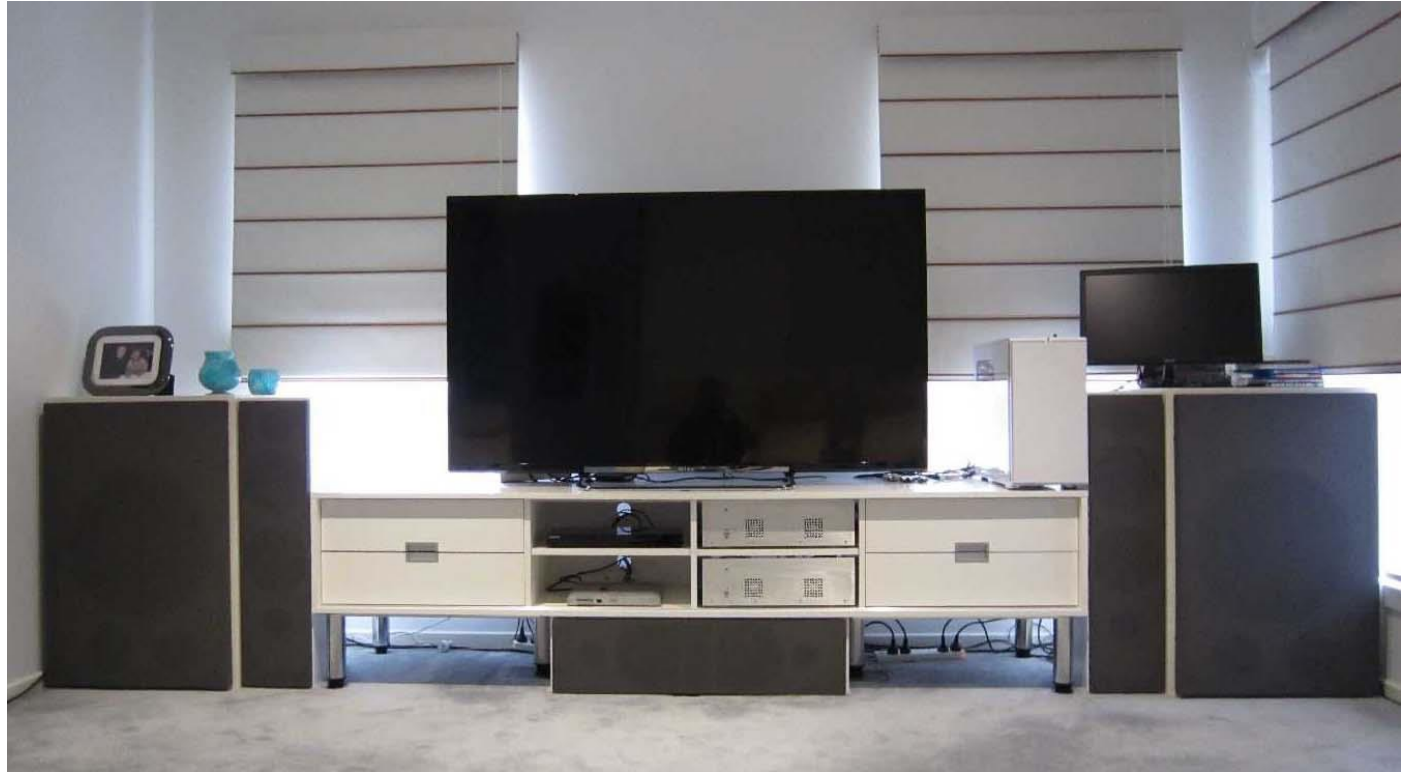
UE6 system – July 2014