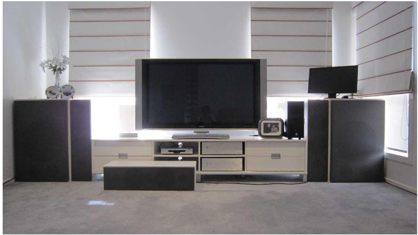
UE4 system prototype – June 2012