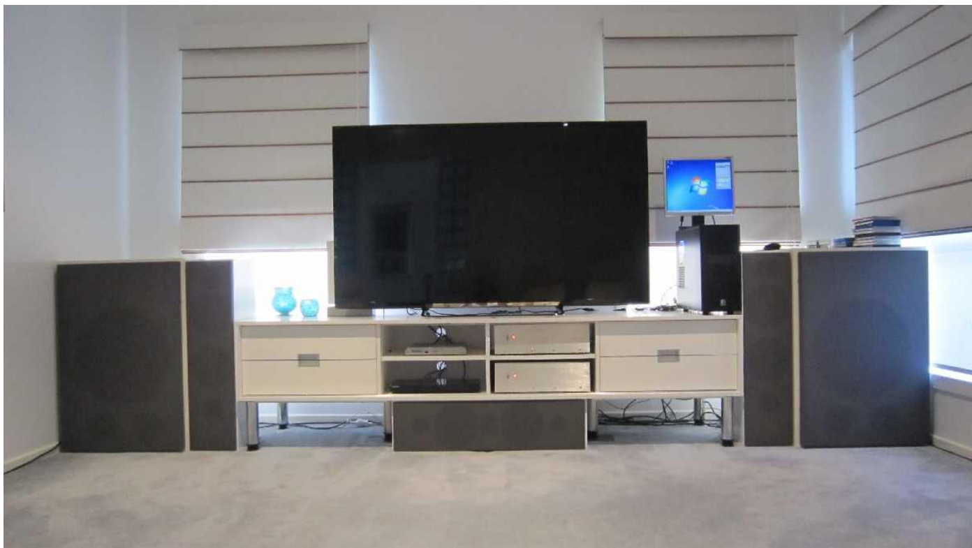
UE5 system – November 2013