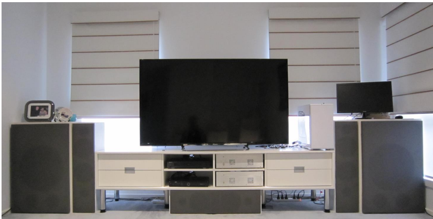
UE 8 System – July 2015