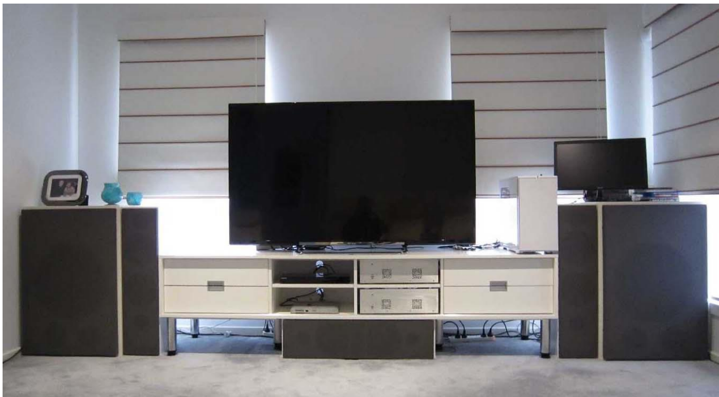
UE6 system – July 2014