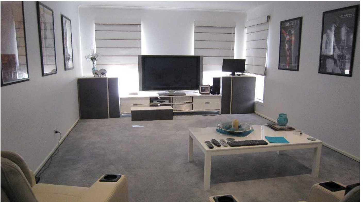
AV room - June 2012

At this stage, only the UE subwoofers were completed – measurements in progress.