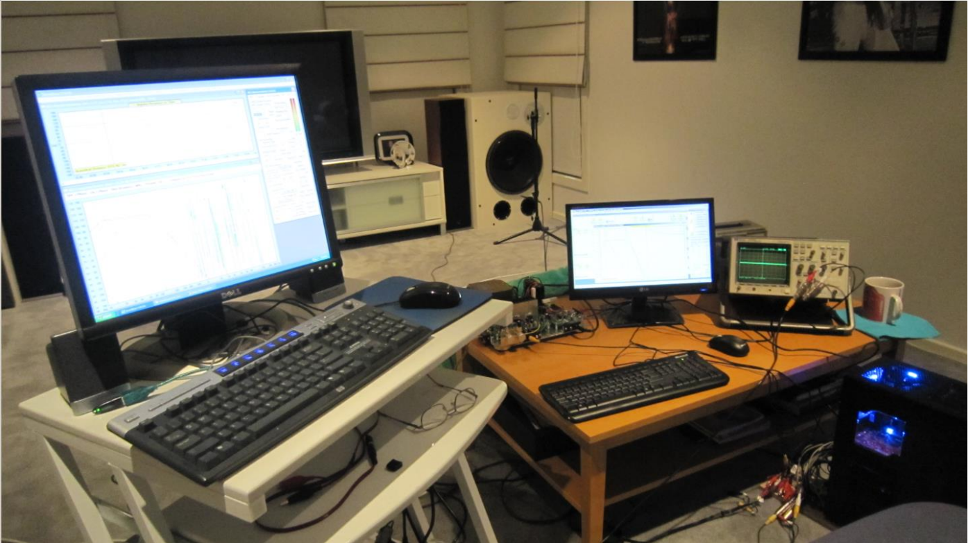
Early 2012 – transitioning from old Dali analogue system to new UE4 system.

At this stage, only the UE subwoofers were completed – measurements in progress.