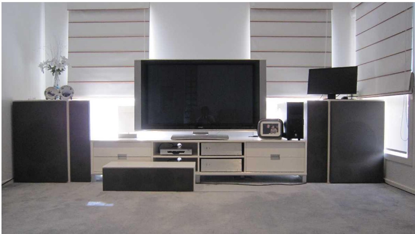
UE4 system – June 2012