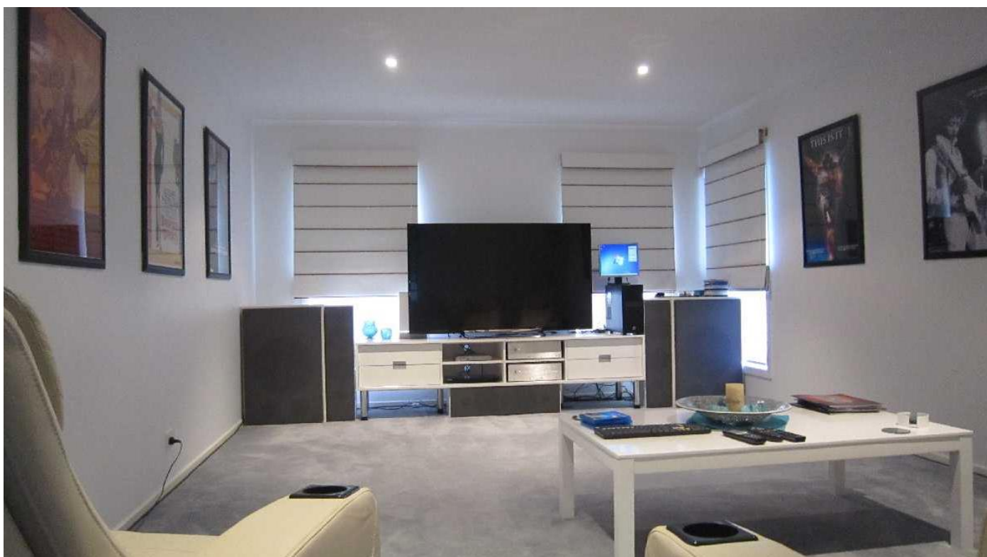
AV room - November 2013